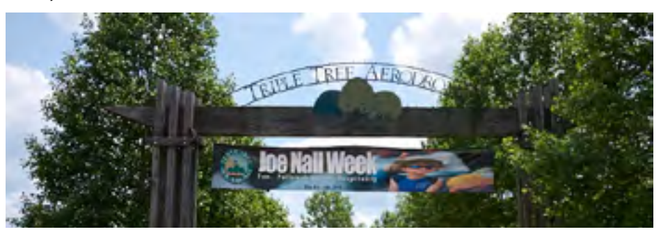
Visit us on Facebook