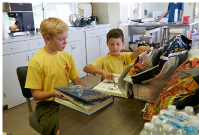
Two of our boy scouts looking through WWII airplane books in the clubhouse