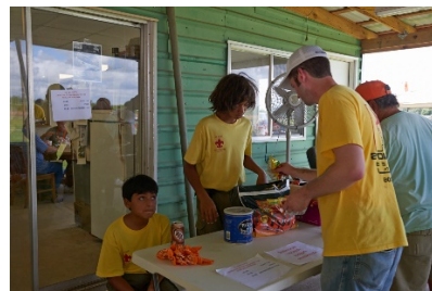
Scouts serving lunch