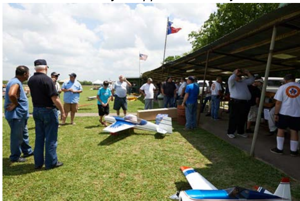
50 cc Thunderbird Raffle Prize donated by RC Jets World