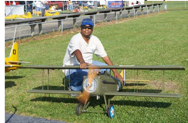
WWI Biplane Ready for a dogfight

Additional photos will be posted on our website in the near future.