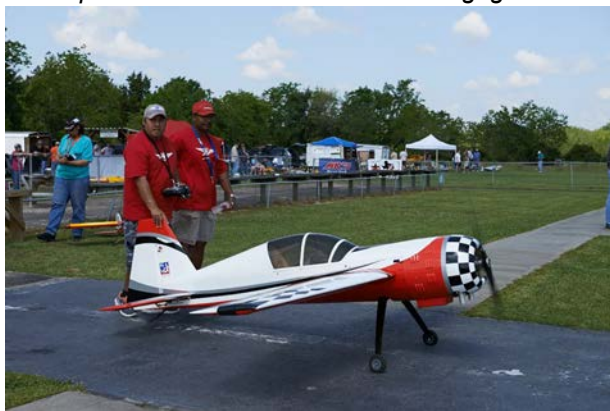
3 D Pilot ready to approach runway