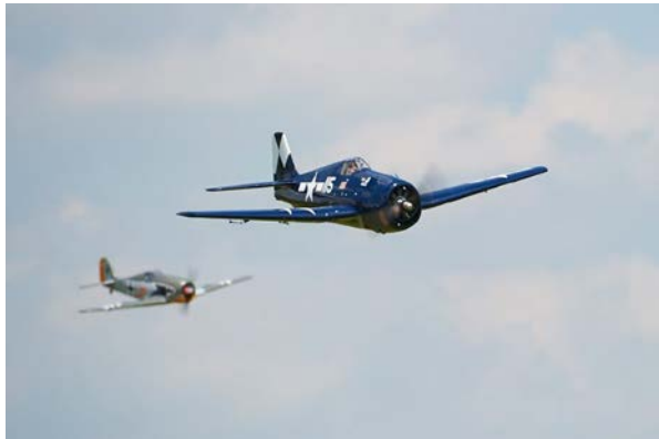
Great picture – looks like real WWII dogfight